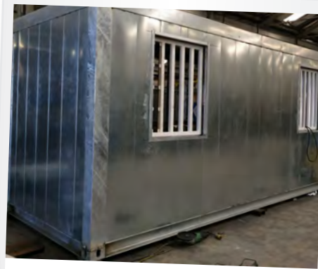
2. Secure metalwork items starting to be installed