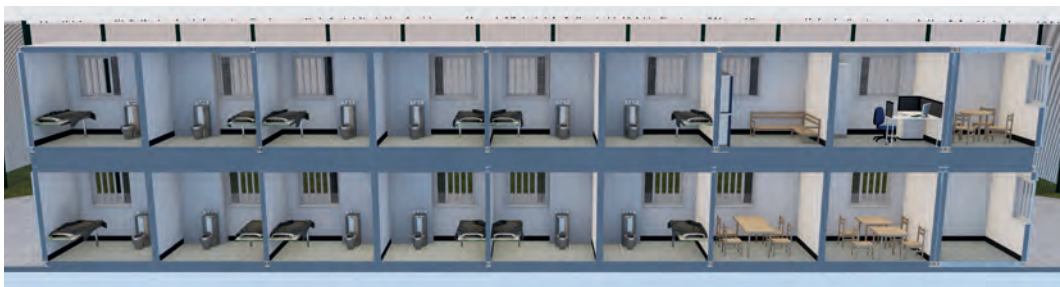
EXAMPLE CROSS SECTION AND OVERHEAD VIEW OF CELLS, CLASSROOMS, KITCHEN AND OFFICES