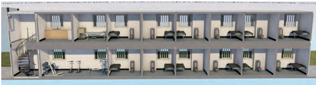
EXAMPLE CROSS SECTION AND OVERHEAD VIEW OF CELLS, GYM, HOSPITAL AND C&R STAIRS