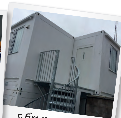
5. Fire escape staircase installed