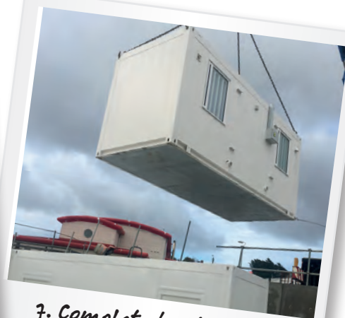
7. Completed units being craned into position