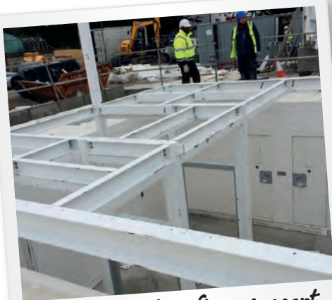
3. Mezzanine floor support steel work in situ