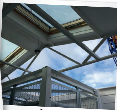
4. Roof panels coming together