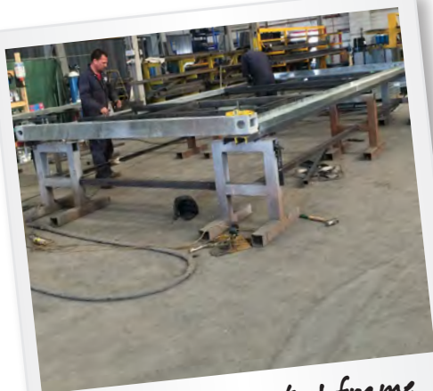
1. From a simple steel frame made in our factory...

We have already completed a project for the Falkland Island Government and here's some images showing the project's progress. From the steel frame being made in our factory to the final fixtures and fittings on the finished product.