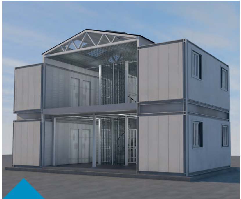
MODULAR PRISON DESIGNED AND CREATED FOR THE FALKLANDS

Whatever your needs, we can build it for you and install it too.