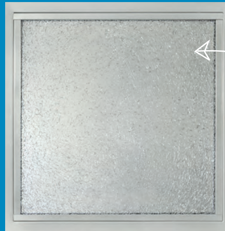
Blast proof glazing screen